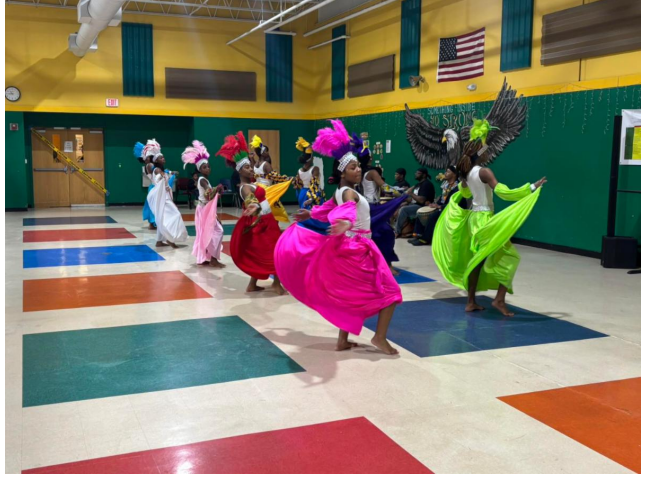
Students at L. Hollingworth celebrated the 100th day of school in style!