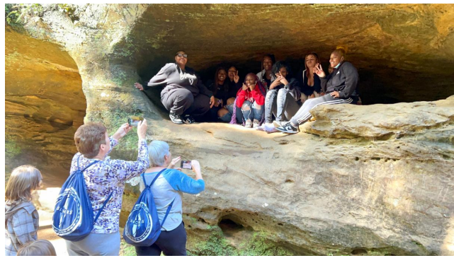
Horizon Science Academy Youngstown has been awarded the Gold Recognition Award for the 2024 Ohio PBIS Showcase! This recognition reflects HSAY's commitment to creating a positive school climate and supporting the success of all students. Congratulations to all of you for your hard work and dedication to your students.